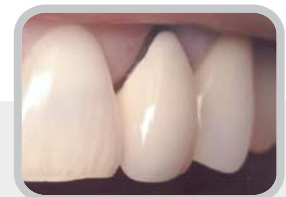
#10 Metal Margin Before

Ivoclar has a new stump shade guide available with expanded shades. This guide has 3 new shades & simulates the shade of the preparation. Used for all-ceramic restorations, this guide is very helpful in reproducing shades of the natural teeth. The name has changed to IPS Natural Die Material and the shades are listed as ND rather than ST. To order one, please contact Ivoclar Vivadent or Creative Arts.