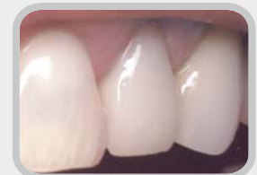
#10 Empress After